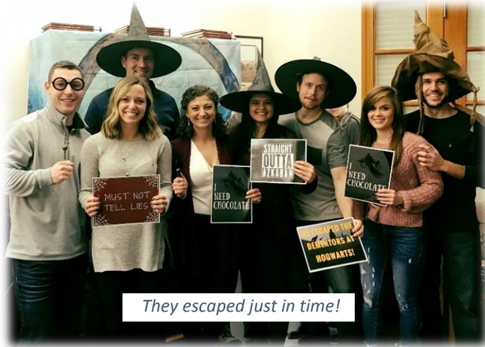
They escaped just in time!

Library Director's Video Link https://animoto.com/play/wUJshvdAU7Z8vBSQhcfHA