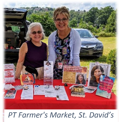
PT Farmer's Market, St. David's