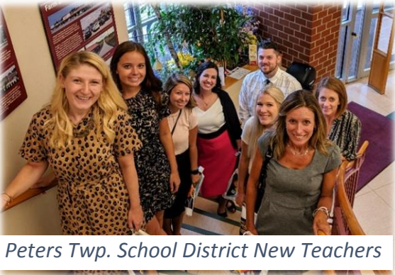
Peters Twp. School District New Teachers