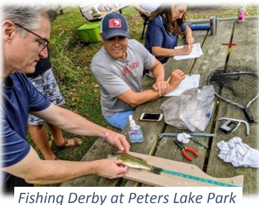
Fishing Derby at Peters Lake Park